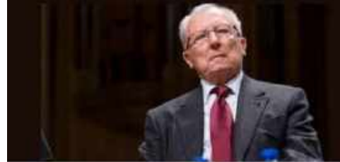
Founding Father of EU's Single Currency Project Jacques Delors Dies Aged 98